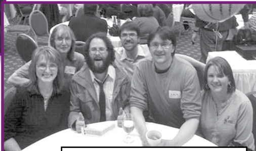
Highest Scoring Team Applied Data Consultants