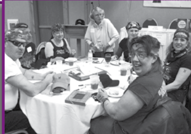
Best Team Costume Sacred Heart Word Hogs